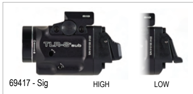
69417 - Sig HIGH LOW