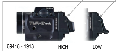
69418 - 1913 HIGH LOW