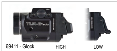
69411 - Glock HIGH LOW

Interchangeable paddle switches easy to swap out with multi-tool (included)