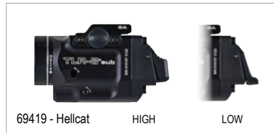
69419 - Hellcat HIGH LOW