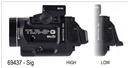
69437 - Sig HIGH LOW