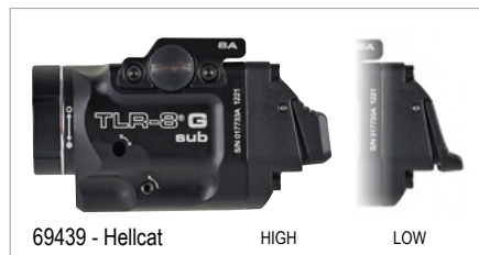
69439 - Hellcat HIGH LOW