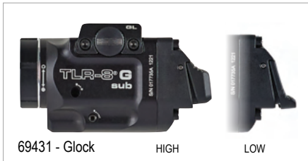
69431 - Glock HIGH LOW