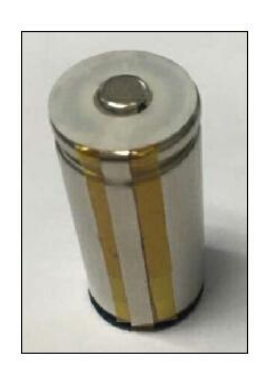
Drawing 1: Battery pack drawings